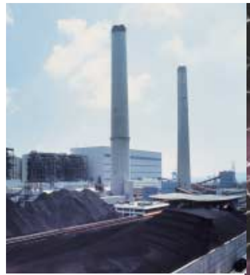
An aerial view of the Lamma Power Station, left, and the coal storage area, above.