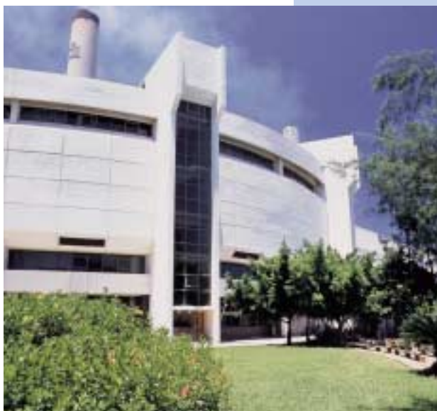
The Admin Building at Lamma Power Station.

As the record shows, the company has been well plugged in to its environment for almost 112 years. It is also impeccably equipped to illuminate the future.