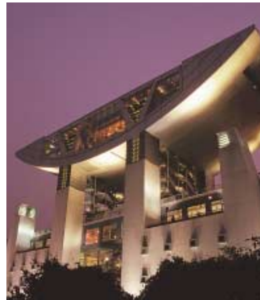
Hongkong Electric supplies all the power that illuminates and energises Hong Kong Island. From left: The stock exchange; city tram; The Peak Tower.