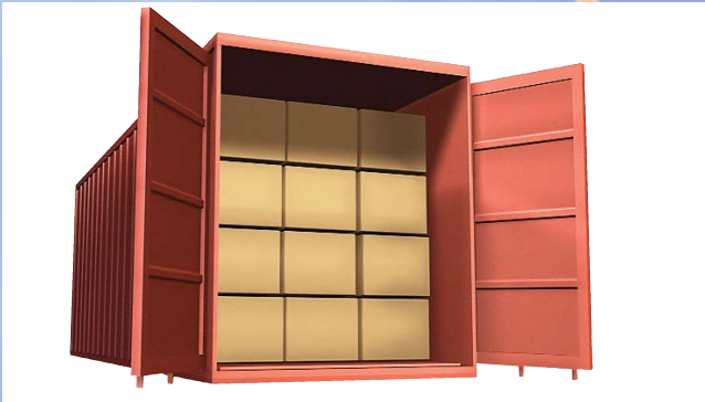
8 The "seal" of the RFID sensor system is finally broken. The movement of cargo within the marine container has been accomplished with a high level of security.