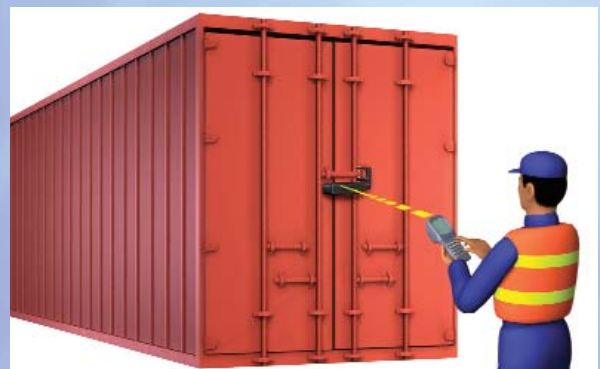
7 The container arrives at its destination port where its integrity is again checked using a hand-held device. Information on key supply chain and security events is immediately available. Business processes have been recorded, and container tamperings, mis-routes and delays have been monitored and reported accurately throughout the global tracking network in real-time.