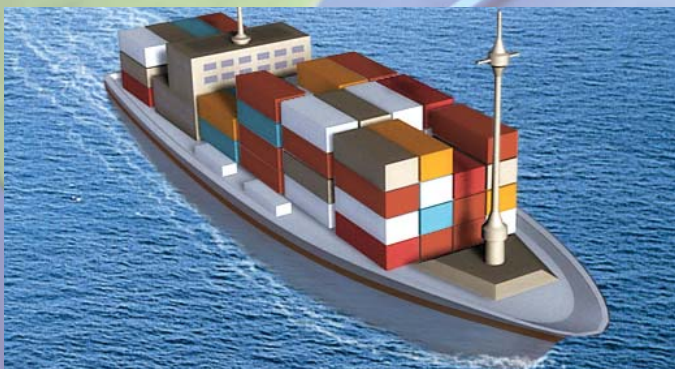
6 Secure containers leave their port of origin on board a vessel. Each container can now be tracked to its final destination along Smart and Secure Tradelanes. (Currently, six lanes are available: HK to Seattle; HK to Tacoma; ECT to NY; Felixstowe to NY; Singapore to LA/LB; Antwerp to NY.)

To date, the main company producing the smart locks is Savi Technology, which clearly has a head start thanks to