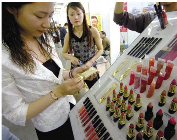
Cosmetics are big sellers in a country where Maggie Cheung (centre photo) is regarded as the epitome of Chinese beauty.

Among the products that she will endorse will be a range of skin whiteners, a popular item with cosmetics brands in all parts of Asia. It is a popularity that puzzles people unfamiliar with the market, especially those from Europe and the United States, where women want to look bronzed.